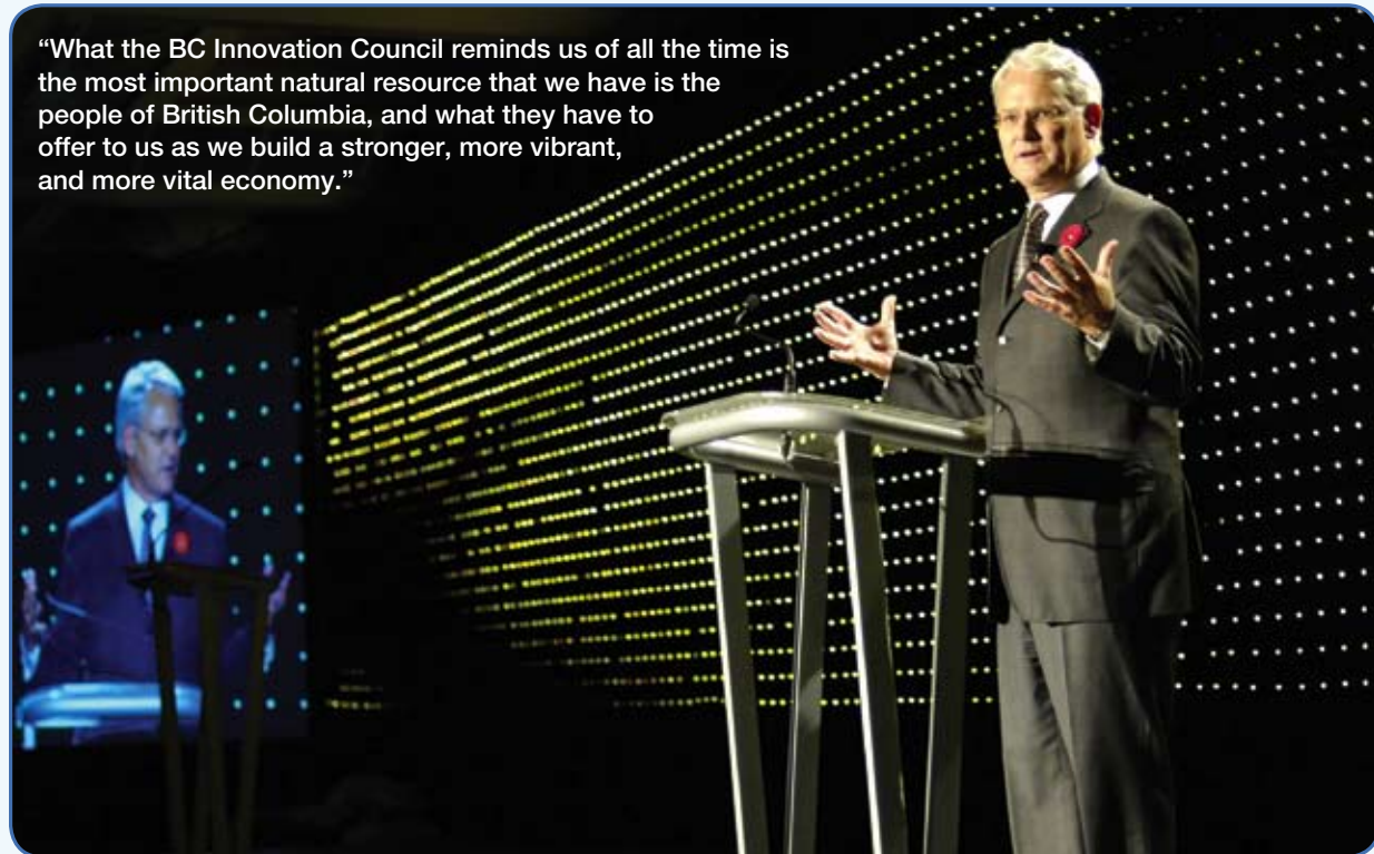
Honourable Gordon Campbell, Premier of British Columbia