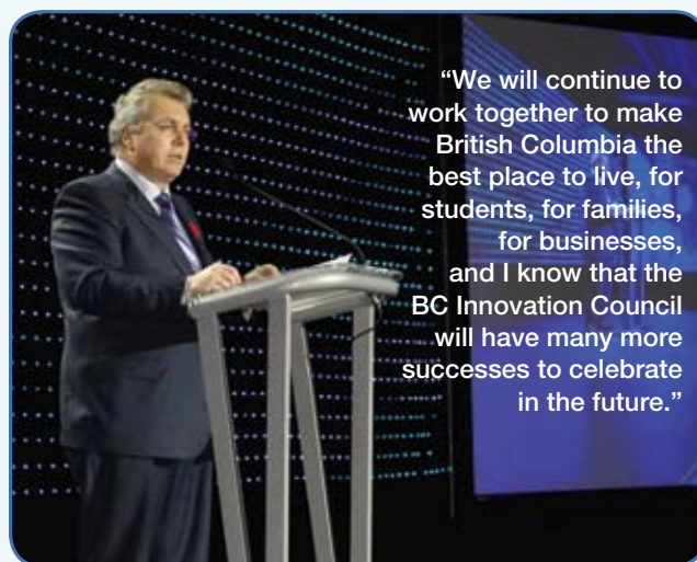
Honourable Murray Coell, Minister of Advanced Education and Minister responsible for Research and Technology